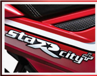
3D Premium Logo