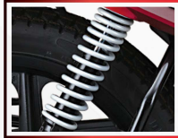
Silver Coloured Shock Absorbers