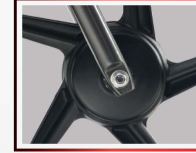
130mm Front Drum Brake