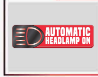
Automatic Headlamp On