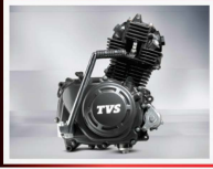
Powerful 110cc Ecothrust Engine