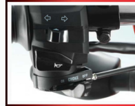
Auto Return Choke