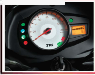
Stylish Digital Display