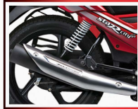
Premium Chrome Muffler