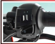
All Gear Electric Start